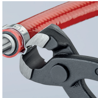
Sealing the fluid hose on the connecting piece