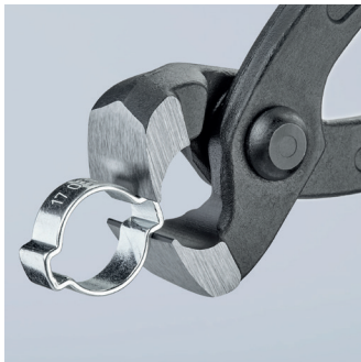
Front press jaw