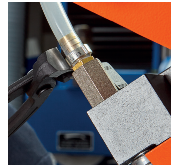
Sealing the hose connection on central lubrication