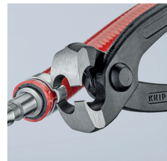
Sealing the fluid hose on the connecting piece using the side press jaw