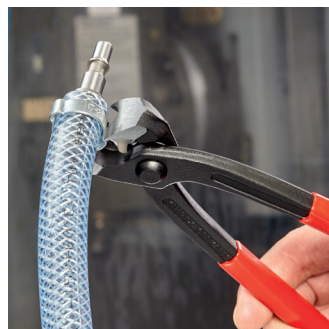
Sealing the pneumatic hose on the quick action coupling using the side press jaw