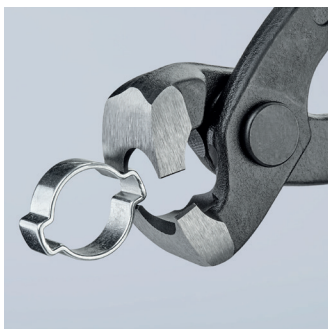
Using the front press jaw