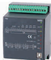
P43 - three-phase transducer of power network parameters