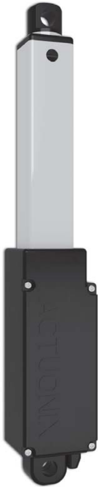
50mm L16 – Actual Size

The L16 actuators are complete, self contained linear motion devices with position feedback for sophisticated position control capabilities, end of stroke limit switches for simple two position automation, or RC servo. Several gear ratios are available to give you varied speed/force configurations.