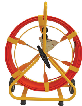
GOOD BUDDY® III