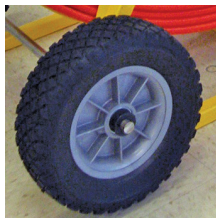
All Terrain Wheel