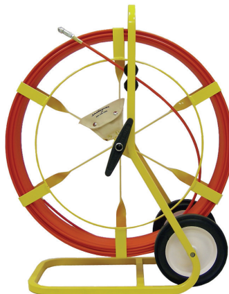
GOOD BUDDY® II