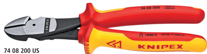
74 08 200 US