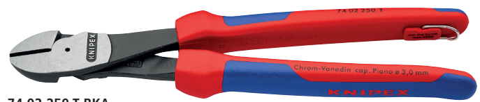
74 02 250 T BKA