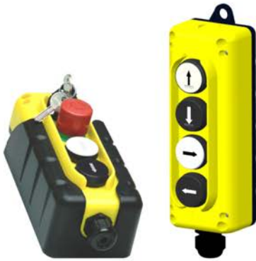
MOBILE-PENDANT FIXING (with WALL BRACKET accessories) WALL FIXING