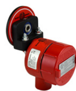
EZ-100 Mounting Option