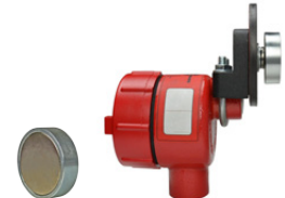
MM-2.00 Mounting Magnet Option (must be used with EZ-100)