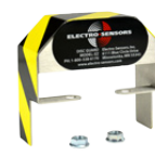
EZ-Mount Disc Guard