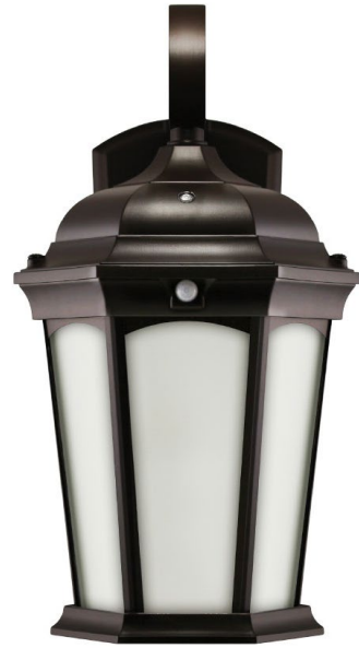
Integrated LED Fixture

*Note: Design, features and specifications subject to change without notice. Some features may not be available on all models. For more information please visit: www.eurilighting.com or call 1-888-743-5766