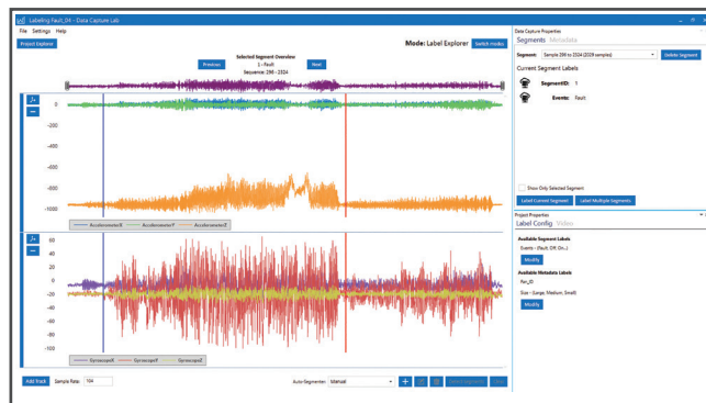
SensiML Data Capture Lab Screen