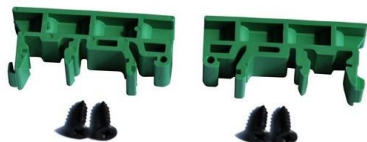
DIN Rail Adapters Included